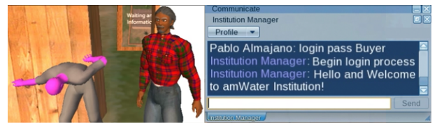
Figure 3: Human avatar login: interaction with a software agent by means of a chat window