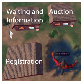
Figure 2: Initial aerial view of v-mWater

market facilitator conducts the auction and the basin authority announces the resulting valid agreements.