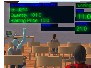
Figure 4: Bot bidding in a running auction

artificial skin colours that represent their roles (see Figures 3 and 4). Fig. 3 shows the login to the institution: the human participant sends a private message to the Institution Manager bot with the password and role (either seller or buyer). Fig. 4 illustrates how human participation in the auction has been improved by providing a comprehensive 3D environment. There, the market facilitator bot appears sited at a desktop and buyer participants at the chairs in front of it. This room includes dynamic information panels. Moreover, bots' bid actions can be also easily identified by human participants since they are displayed as raising hands.